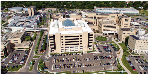
Beaumont, Royal Oak

Beaumont Hospital, Royal Oak Applebaum Simulation Learning Institute 3601 W. 13 Mile Road • Royal Oak, MI 48073